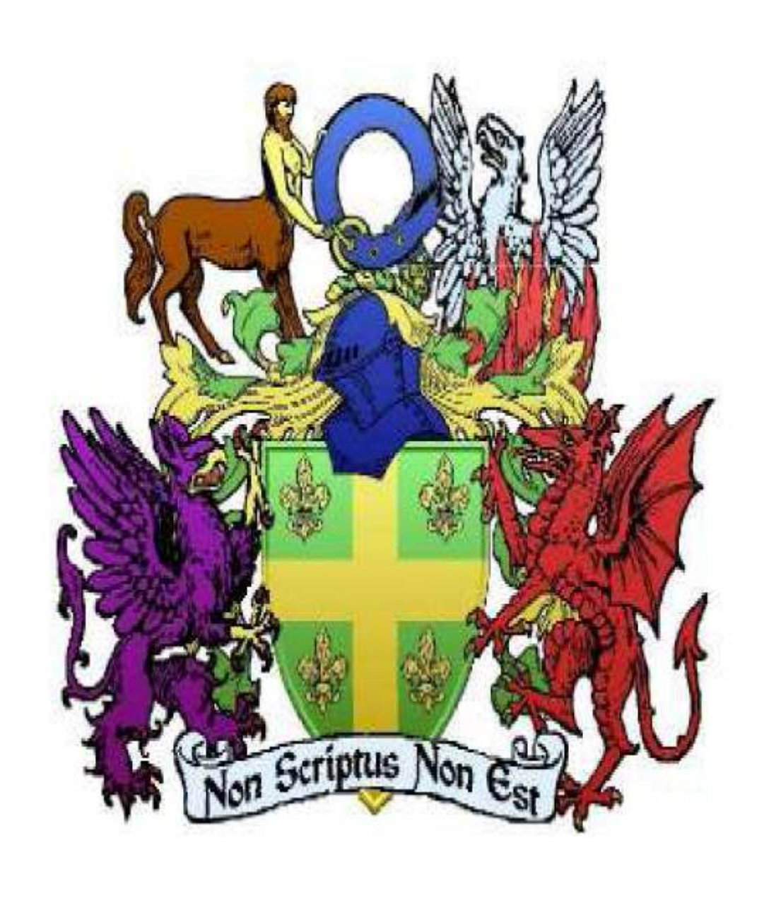
Letter of Registration and Return July 2008